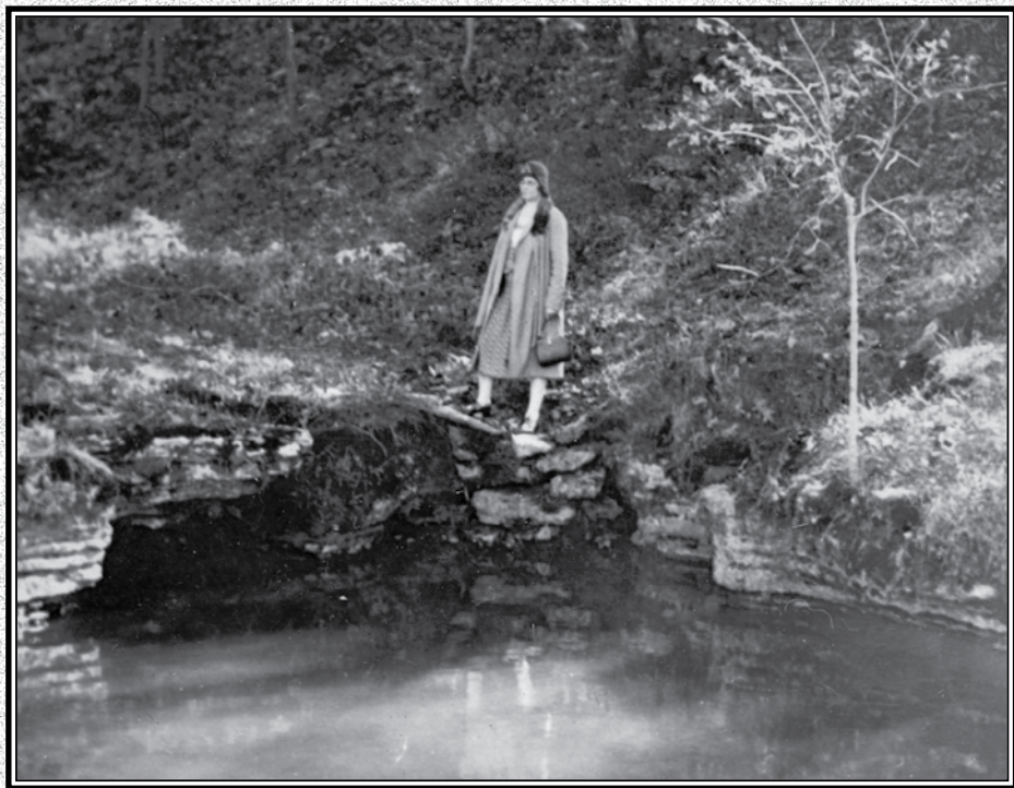
Woman by an Ozarks Spring