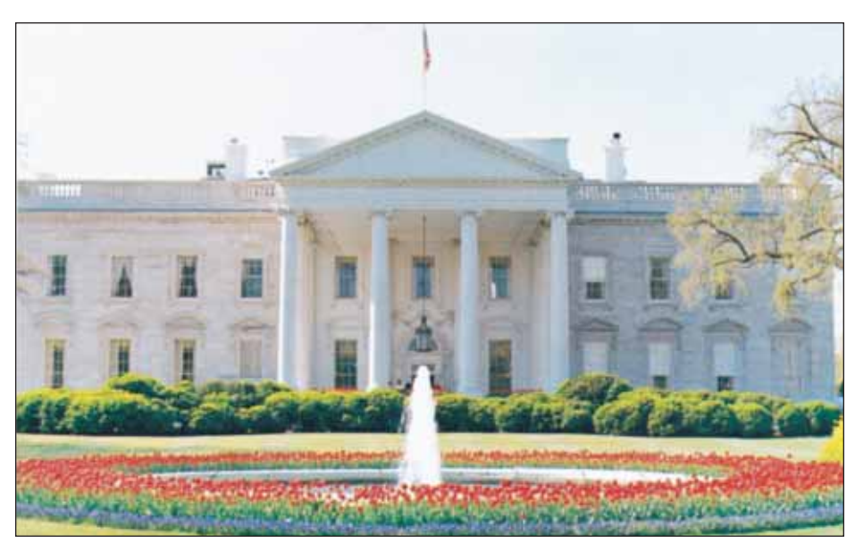
The White House, Washington, D.C.