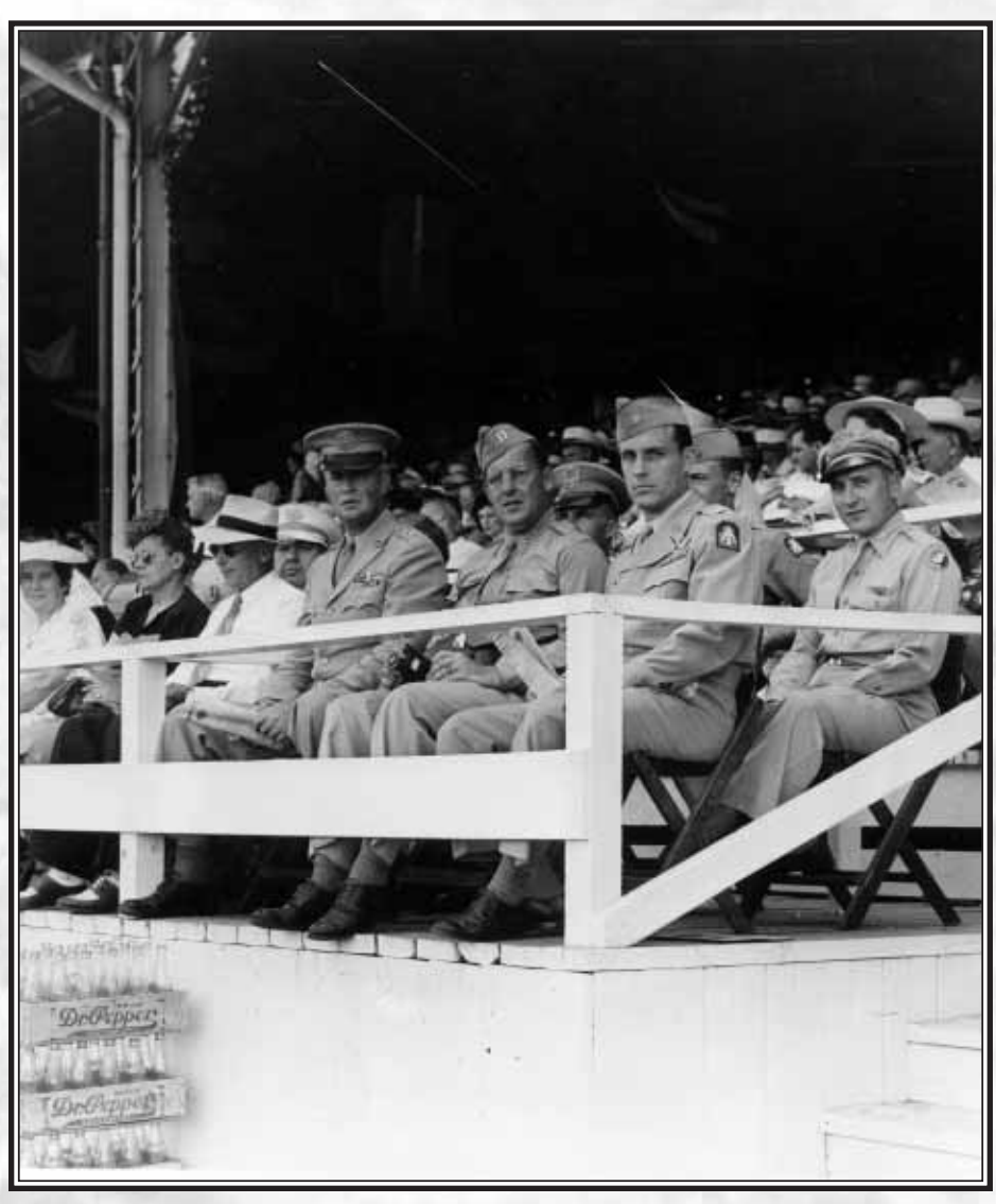
Military Personnel Enjoying the Missouri State Fair, c1940s.