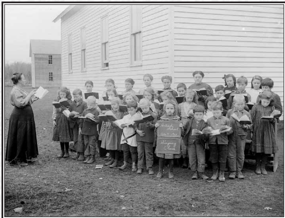
Antioch School singing class, 1908