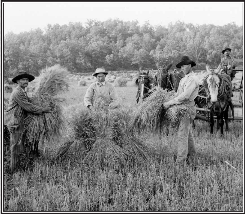
Harvesting wheat at the O.E. Clark farm, c1910