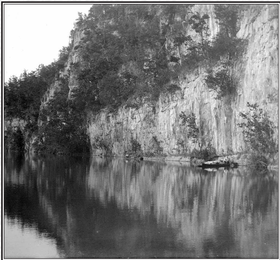
Tree lined bluff and river, 1916