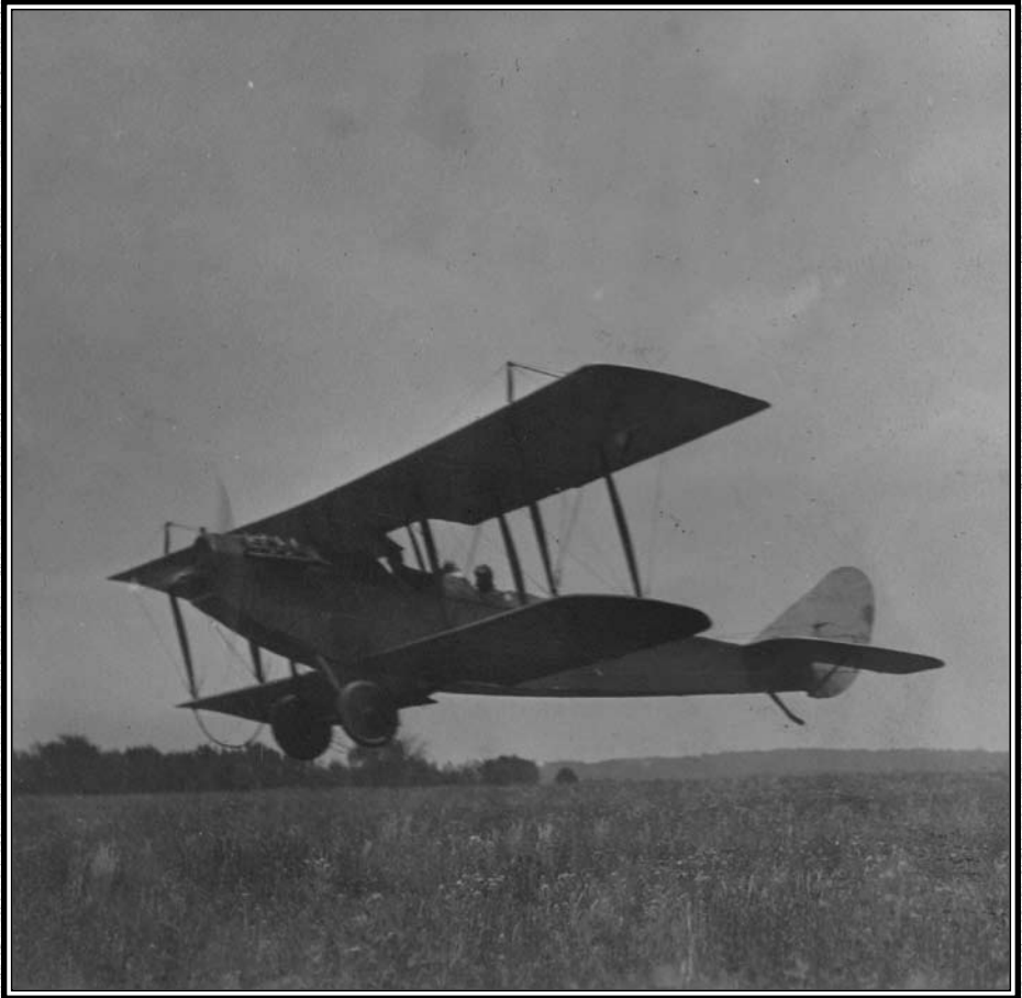
Bi-plane over a field, n.d.