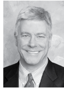
LT. GOVERNOR PETER KINDER Member, Missouri Community Service Commission