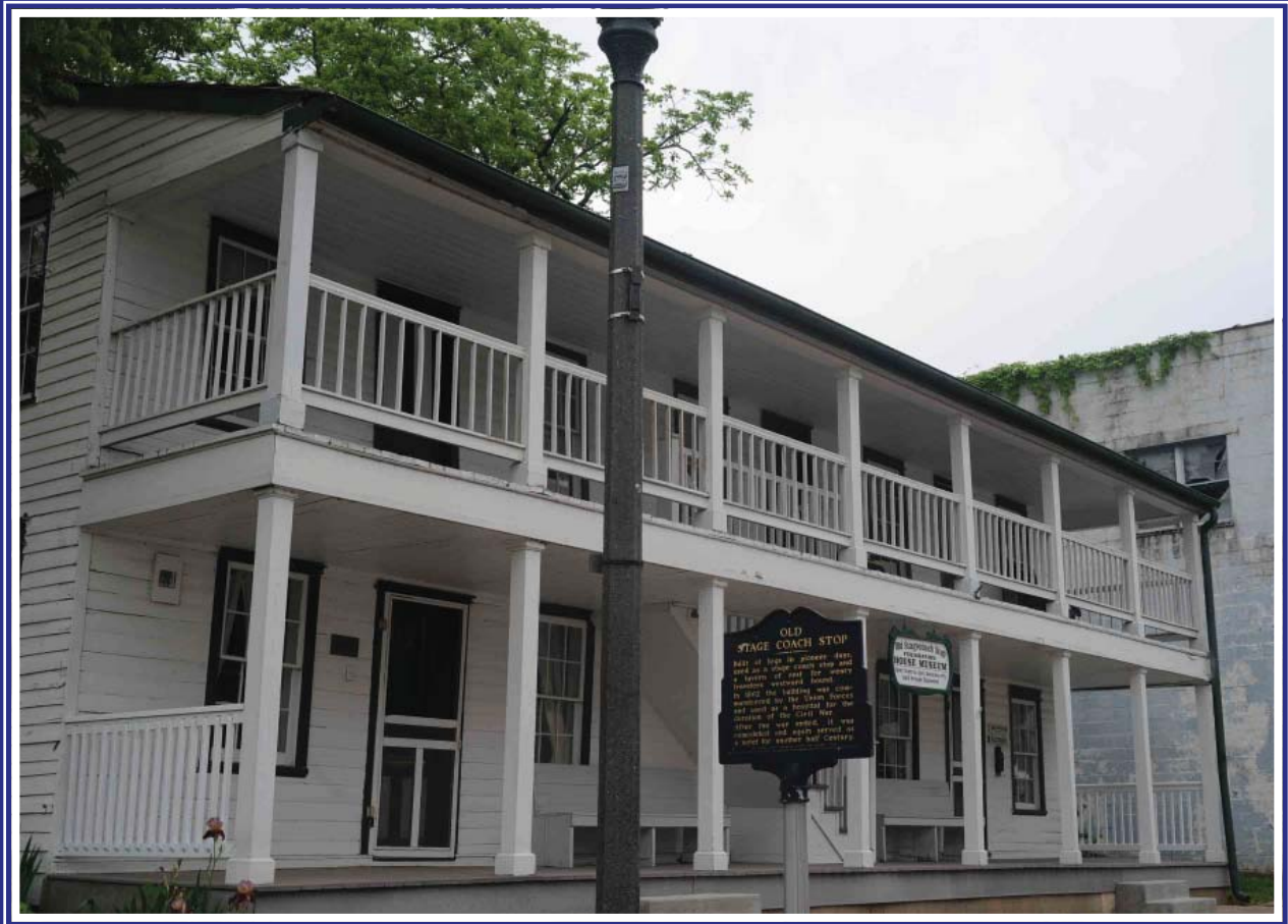
In 1862, the Old Stagecoach Stop in Waynesville was commandeered by Union soldiers and used as an infirmary for the Waynesville Fort (Commanded by Col. Albert Sigel), until the war ended in 1865. Built in the 1850s, the Old Stagecoach Stop is Pulaski County's oldest building.