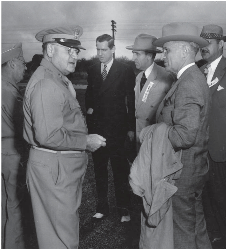
Senator Harry Truman, September 1944, Camp Crowder.