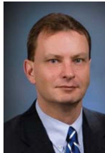
VICTOR CALLAHAN Commissioner State Tax Commission