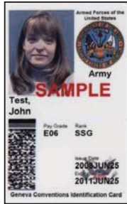
1 Federal Government