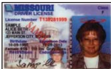
1 Missouri Driver's License