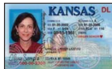
4 Out of State Driver's License