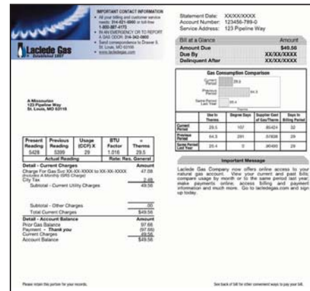
3 Utility Bill