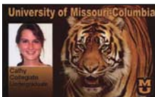
2 Missouri Institution of Higher Education