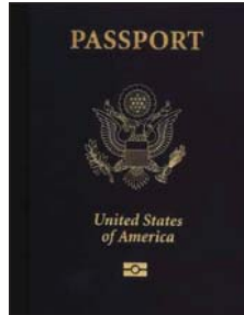
1 Federal Government