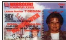
1 Missouri Non Driver's License