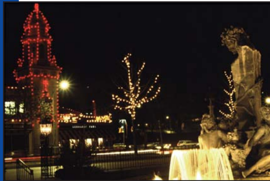
Country Club Plaza