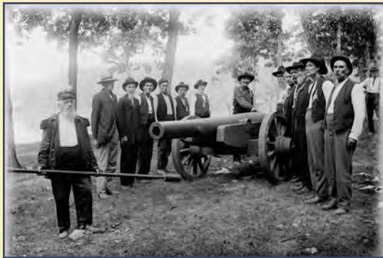
Soldiers' reunion, Mammoth Springs, Arkansas, c. 1908.

We tend to view the American Civil War as a conflict between two distinct cultures divided by the Ohio River; the South devoted to the protection of slavery as an institution, and the