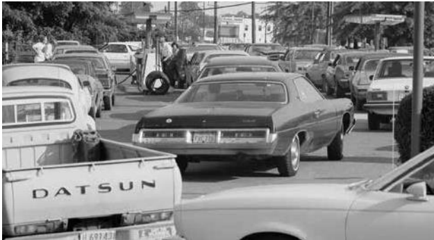
United States' support of Israel during the Arab-Israeli War led to an oil embargo. As a result, Americans experienced a gasoline shortage that led to rationing and an economic crisis relating to high prices, 1973.

Consider the history of the Middle East. One example was the creation of the State of Israel in 1948. How were diplomatic relationships carried out in the area? What role did the United States and Great Britain play? What were the long-term consequences for Israel? For diplomacy in the region? Or, students might be curious about the 1973 Arab-Israeli War and subsequent peace negotiations. What happened, and how did it impact the United States and other nations? What effect did these diplomatic relations have on the world economy?