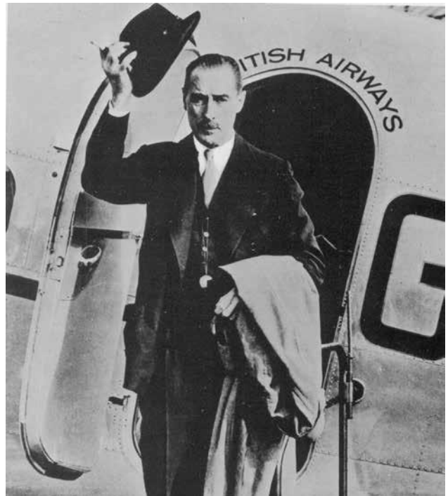
Neville Henderson, the British Ambassador to Germany, departing Croydon Airport to fly to Berlin, Germany, August 1939.

Others might look at how New Zealand established itself as a diplomatic force during World War II and its active involvement in building the United Nations (1945). Before World War II, New Zealand maintained only one foreign outpost in London, England. What changed for New Zealand? What new alliances did New Zealand establish? How did treaties involving New Zealand, such as the ANZUS (Australia, New Zealand, United States) Defence Treaty in 1951 and SEATO (Southeast Asia Treaty Organization) in 1954, influence New Zealand's status as a world power? Why did New Zealand seek to establish relationships with the United States, Canada, and Asian countries?