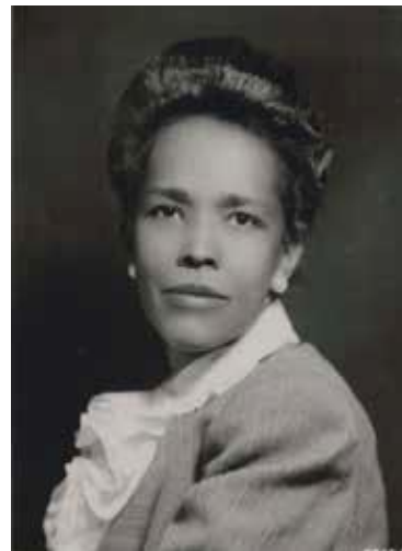
Ella Baker served as an activist from the 1930s to 1980s, working in several major organizations. Her papers are archived at the New York Public Library's Schomburg Center for Research in Black Culture.

Students interested in civil rights might investigate the role women played in the movement. Consider debates that occurred between African American women and their male counterparts. How did this affect and shape the movement? For instance, Ella Baker, a major proponent of the Civil Rights Movement, fought sexism in both the National Association for the Advancement of Colored People (NAACP) and the Southern Christian Leadership Conference (SCLC). 1 What were the results of these debates? Baker eventually left to help organize and advise the Student Nonviolent Coordinating Committee (SNCC). What influence did she have on the Civil Rights Movement?