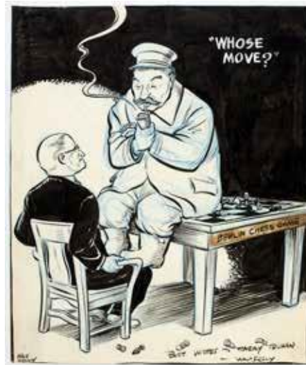
The 1948 political cartoon showed Josef Stalin seated on a table marked “Berlin Chess Game.” Stalin attempted to remove western influence in West Berlin, an area situated in communist East Germany. Truman’s and Stalin’s actions were depicted as a game of chess between two nations vying for dominance. ©Okfenokee Glee & Perloo, Inc. Used with permission.

Consider the many different topics surrounding the Cold War (1947–1991). The Cold War exposed many social and cultural issues in the Soviet Union and the United States. Students might explore the Berlin Blockade (1948–1949), the Cold War's first crisis. Soviet Premier Josef Stalin blocked U.S., French, and British railway, road, and water access into West Berlin, hoping the western powers would surrender the city. What was the initial impact of this action? How might the events have launched the U.S. and its allies into another war? How did this crisis affect the diplomatic relationship between western powers and the Soviet Union? Students might explore other Cold War topics such as the Truman Doctrine (1947), the Korean War (1950–1953), the Kitchen Debates (1959), or the Cuban Missile Crisis (1962). Who was involved? Were these events instances of successful diplomacy, or were they diplomatic failures? How did their success or failure affect the relationship between the Western and Eastern blocs during the Cold War?