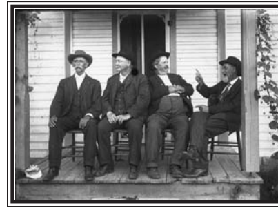
Missouri State Archives