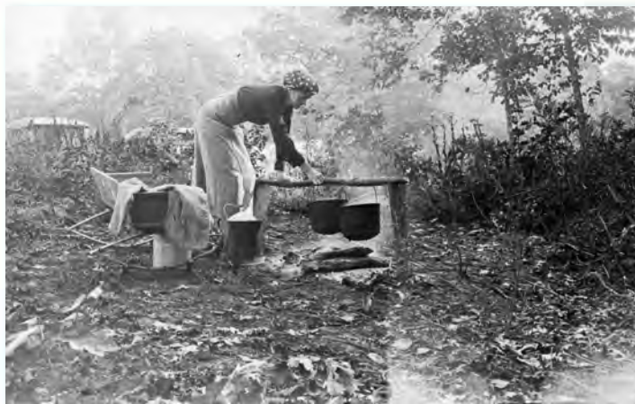
Woman making soap — circa 1915