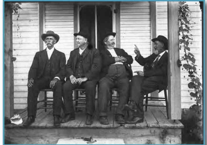
Four Men on a Porch

We hope you are able to visit the Information Center to view Missouri Memories during coming months. Exhibit brochures will be available from the reception desk located at the entrance to the