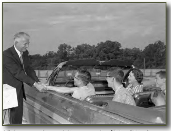
Minister greeting parishioners at the Glaize Drive-In Church

The Glaize Drive-In Theater eventually folded like many drive-ins, and Hope Lutheran Chapel became a self-supporting parish in 1979. Although the church would change buildings and locations between 1965 and 1988, it never abandoned the drive-in concept. Between Memorial Day and Labor Day, visitors to the Lake area can still participate in "A Unique Worship Experience" at the Hope Lutheran Chapel in Osage Beach, complete with worship materials, music and communion. And, they can even take their dogs.