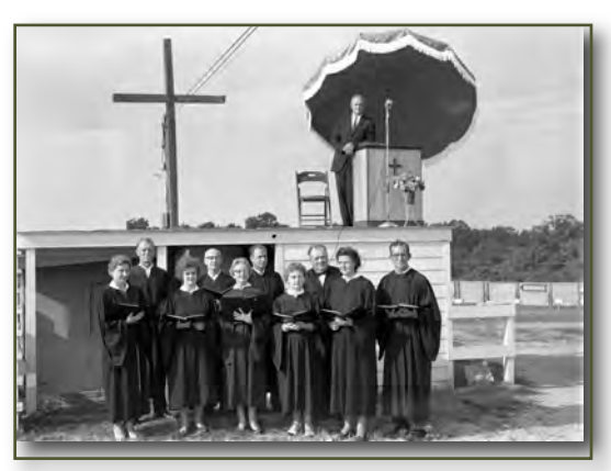
Choir performance at the Glaize Drive-In Church, 1961