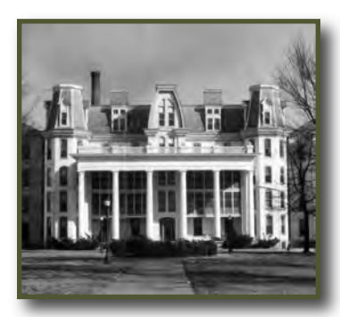
Fulton State Hospital Administration Building

Over one and a half centuries ago, at a time when mental health was barely understood, Fulton State