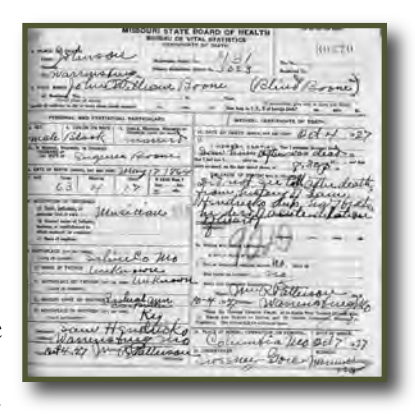
Death Certificate of Ragtime Composer Blind Boone Missouri State Archives

The AASLH awards program was initiated in 1945 to encourage standards of excellence in the collection, preservation and interpretation of state and local history. Awards not only honor signifi-