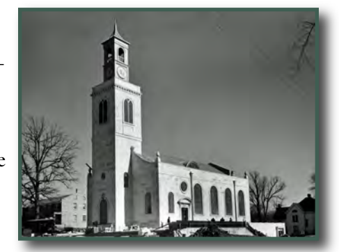
Churchill Memorial Construction

come to describe the division between the Western powers and the Soviet Union during the Cold War. Westminster College established the Winston Churchill Memorial and Library in 1969 as a tribute to Churchill's life and legacy. The me-