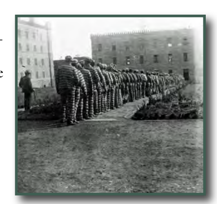
Missouri State Penitentiary

has prosecuted thousands of cases, from misdemeanors to capital murder cases. Some of his cases have been featured on the Oprah Winfrey Show , Dateline, Arrest & Trial and Forensic Files .