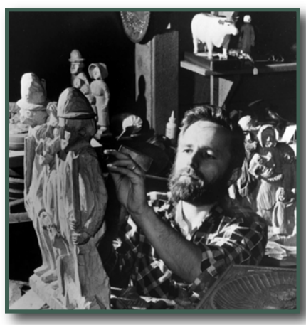
Wood Carver

Jefferson City's Memorial Park will once again come alive for a unique gathering of talented folk artists, musicians and craftsmen. People of all ages will be treated to live demonstrations of traditional basket weaving, chair caning, loom weaving, soap making and wood carving. In addition, visitors can enjoy good food, a variety of craft vendors and a beautiful