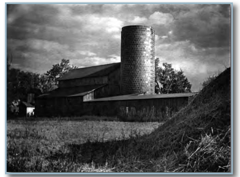
Barn and Silo, by Louise Putman Missouri State Archives, Louise and Omar Putman Photograph Collection

Omar and Louise loved to capture shapes and light in their photography. They experimented with exposures and papers to create different affects. The collection consists primarily of portraits, agricultural and industrial scenes, and many images documenting Kansas City life and buildings. Many of the photographs capture the variety of structures one would find today while driving through northern Missouri or Kansas, such as water towers, barns, and silos. The Putmans photographed these structures to capture their unique shapes against the rural landscape.