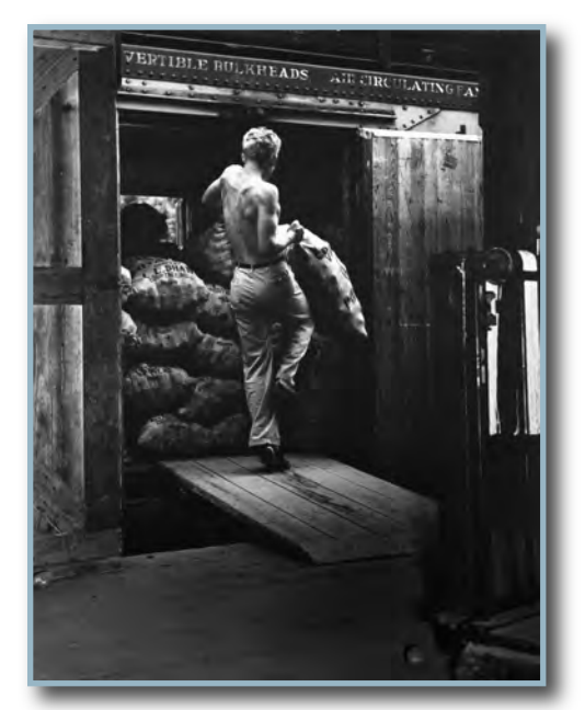
Potato Loader