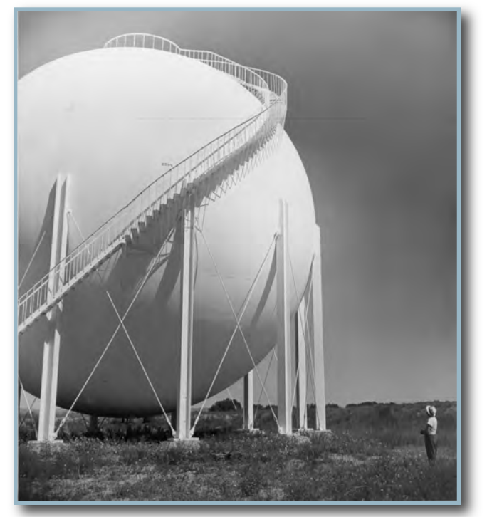
Natural Gas Storage, Somewhere in the Midwest, by Louise Putman Missouri State Archives, Louise and Omar Putman Photograph Collection

Omar and Louise loved to capture shapes and light in their photography. They experimented with exposures and papers to create different affects. The collection consists primarily of portraits, agricultural and industrial scenes, and many images documenting Kansas City life and buildings. Many of the photographs capture the variety of structures one would find today while driving through northern Missouri or Kansas, such as water towers, barns, and silos. The Putmans photographed these structures to capture their unique shapes against the rural landscape.