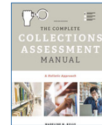
The Complete Collections Assessment Manual

Discover more of our new Library Professional Development titles as well as recorded webinars, government publications, and more on the Missouri Library Staff Guide .