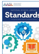
National School Library Standards for Learners, School Librarians, and School Libraries