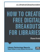
How to Create Free Digital Breakouts for Libraries

Discover more of our new Library Professional Development titles as well as recorded webinars, government publications, and more on the Missouri Library Staff Guide .