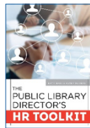
The Public Library Director's HR Toolkit