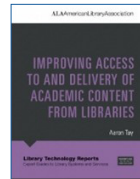
Improving Access to and Delivery of Academic Content