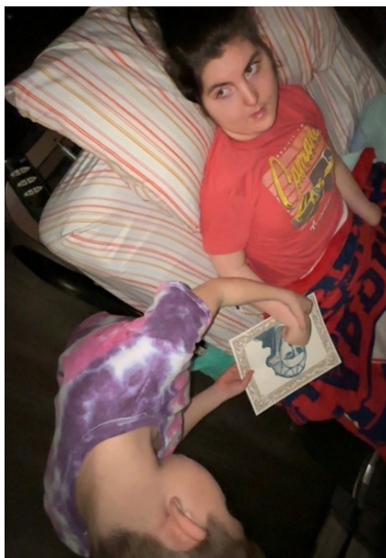
Siblings work together to complete their portrait of George Washington.