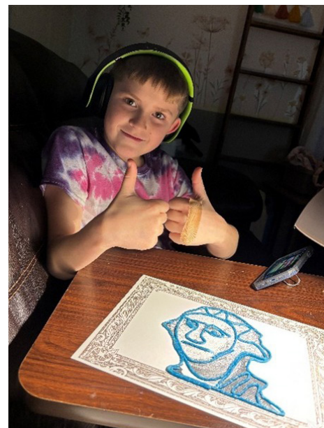
One sibling shows off their completed portrait of George Washington.

Wolfner Talking Book and Braille Library offers adult and youth mail and make programs. Youth patrons ages 8 through 13 can sign up for these awesome creative crafts at Wolfie's Mail and Make Program . Crafts are mailed out four times a year. Each kit has a theme and contains an accessible craft and directions in large print, video-audio, or braille if requested. Kits also come with a list of featured titles that patrons can borrow in an accessible reading format (audio, large print, or braille) to learn more about the topic.