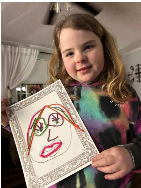
AAWolfner patron showing off herAA completed self-portrait.