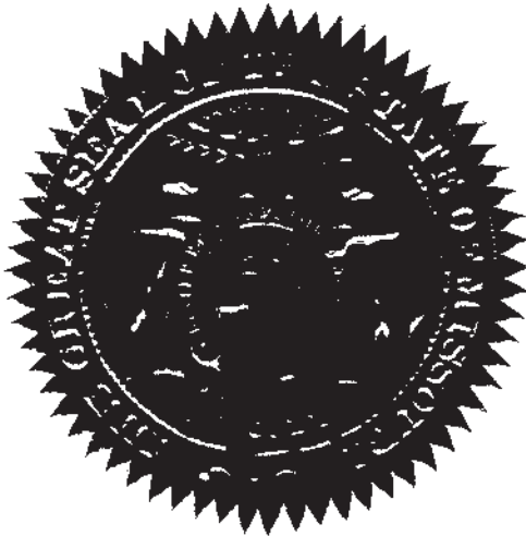
Matt Blunt Governor

IN WITNESS WHEREOF, I have hereunto set my hand and caused to be affixed the Great Seal of the State of Missouri, in the City of Jefferson, on this 26th day of August, 2005.