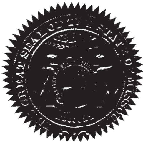
Matt Blunt Governor

IN WITNESS WHEREOF, I have hereunto set my hand and caused to be affixed the Great Seal of the State of Missouri, in the City of Jefferson, on this 21 st day of September, 2005.