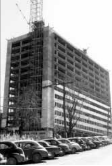
Construction of the Jefferson State Office Building, January, 1952