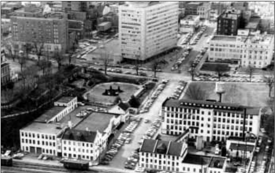
Lohman’s Landing, c1955