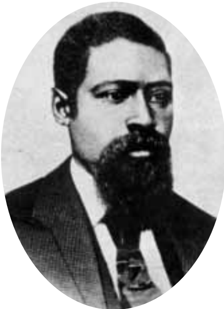
James Milton Turner

The tenure in office of the Radical Republicans was short-lived. Democrats complained that Republicans had run up the state debt to $36 million during the war and that they had used the power of the central government to encroach on local rights and privileges. A Democratic governor was elected in 1872 with a promise of restoring fiscal conservatism to state government and returning much power back to local communities.