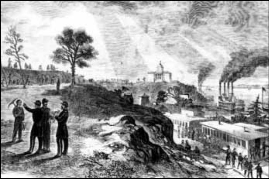
View of Jefferson City showing new fortifications and the arrival and departure of troops, Harpers Weekly , Oct. 19, 1861