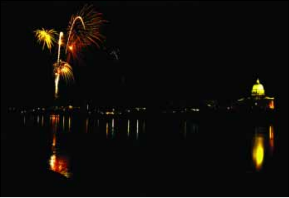
Fireworks display at the Missouri State Capitol