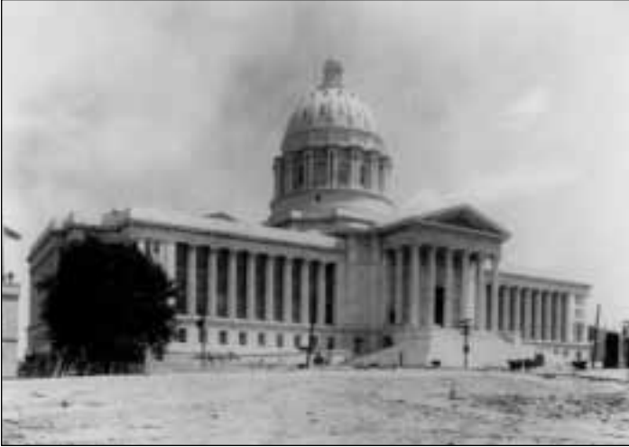
Completed Missouri State Capitol, 1917