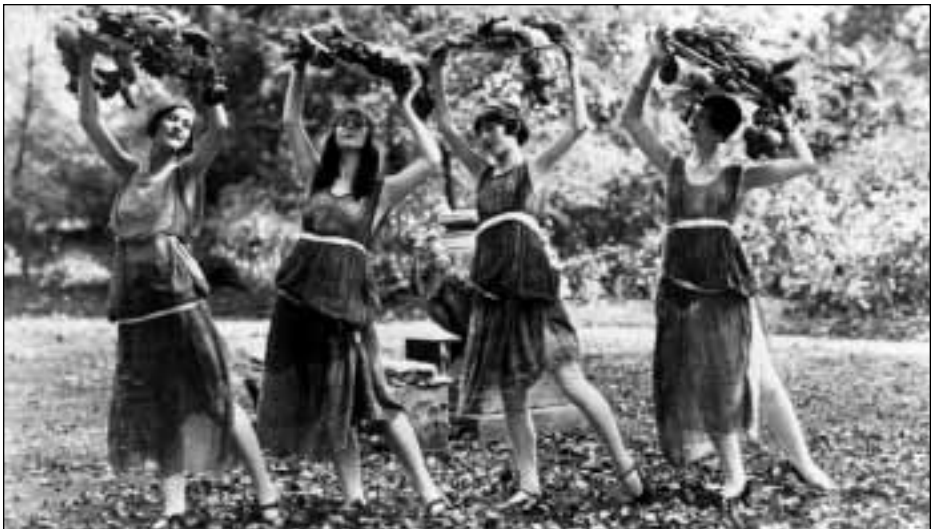
Capitol Dedication, St. Louis ballet dancers, 1924