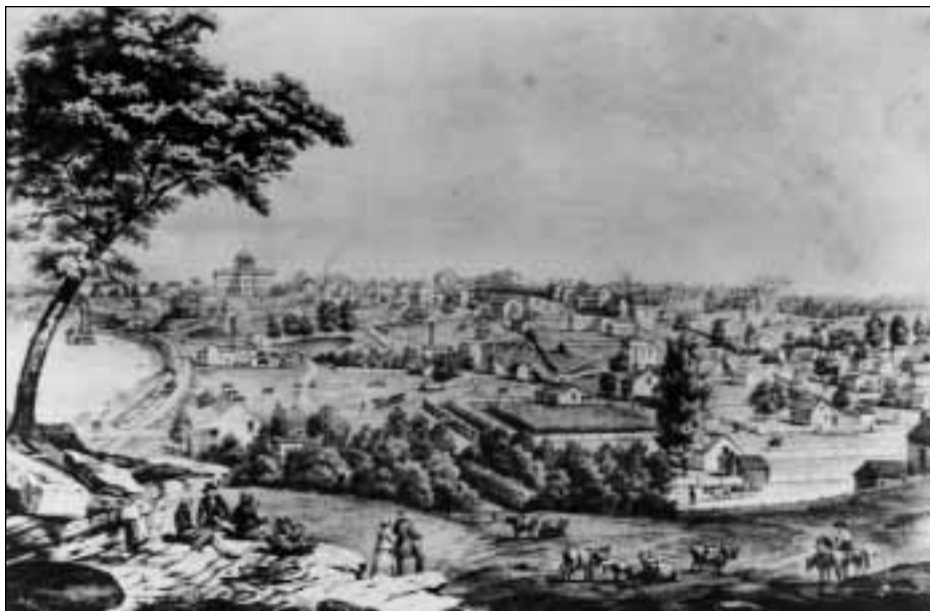
Sketch of Jefferson City, c1850