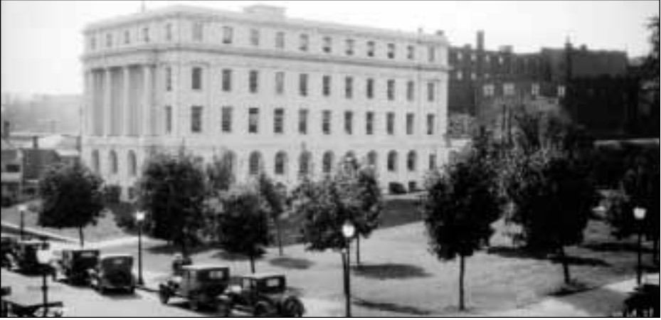
Highway Department Building, 1931