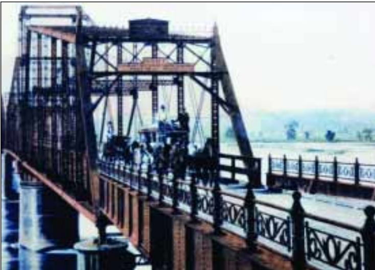
Missouri River Bridge Opening, 1896

Arguably, the most popular national political leader to visit the capital city during the 1890s was the three-time Democratic presidential candidate, William Jennings Bryan. The "Great Commoner," as he was known, made multiple trips to Jefferson City as both a Chautauqua speaker and as a political campaigner during the 1890s. In 1899, for example, he delivered an oration on the virtues of "Free Silver" to a crowd of five thousand people from the steps of the Capitol. According to a local newspaper account of the event, Bryan, whose speech had taken two hours, "apologized somewhat for trespassing upon the time of the audience." Rather than being offended or bored, the crowd responded with "many calls for him to proceed further."