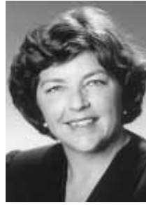
REP. MARSHA CAMPBELL Member, Women's Council