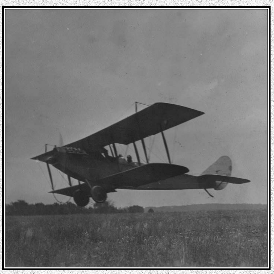
Bi-plane over a field, n.d.