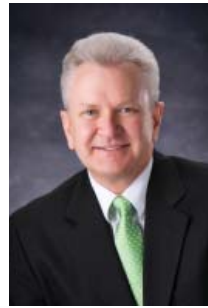
JIM WRIGHT Chair Missouri Ethics Commission

The MEC is composed of six members, not more than three of whom may be from the same political party. These members must be from different congressional districts, and no more than three can be from an odd- or even-numbered congressional district. The governor appoints the members of the commission with the advice and consent of the Senate.