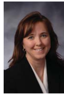
RENEE SLUSHER Deputy Commissioner / General Counsel