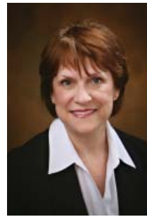
TUCK VANDYNE Office on Women's Health