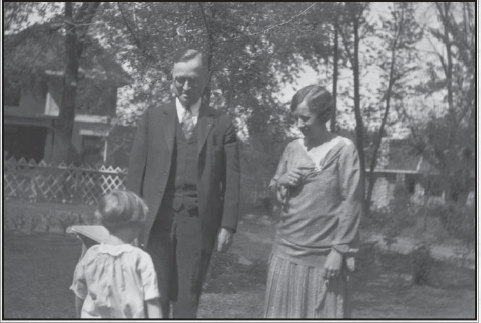
Truman informal family photo, 1928.