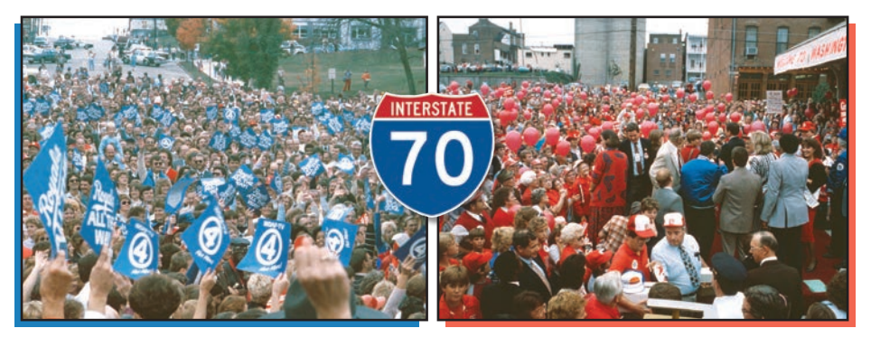
In 1985, Missouri's two professional baseball teams were pitted against each other: Kansas City Royals and St. Louis Cardinals. The Royals won four games to three. Pictured here are fans from each team.

Sports have always been a big part of our state. In just the last few years, we've brought home both the Stanley Cup and the Lombardi Trophy. The Kansas City Chiefs and Royals, and the St. Louis Blues and Cardinals, all have incredibly loyal fans – many whose love for their team spans generations. The Special Olympics Training Center in Jefferson City is unique in America, as are so many of our sports fans and athletes.