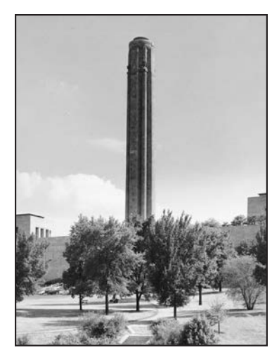
National WWI Museum and Liberty Memorial in Kansas City.

You can't write American history without the pivotal role played by our state. Westward expansion got to Missouri quickly, and less than a generation after the Revolution, Missouri was the gateway to the West.