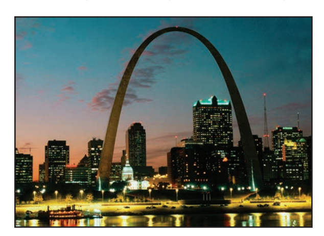
Evening view of the St. Louis skyline as seen from the Mississippi River. The Gateway Arch is in the center, the old St. Louis Courthouse below it and many tall skyscrapers behind.

As a former history teacher, one of the things I appreciate most about Missouri is all of the places where you can see and experience our history. You can stop