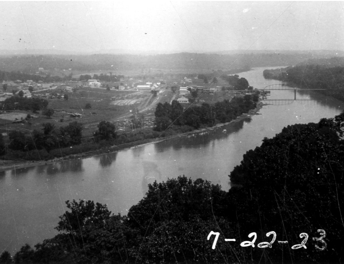
Bird's eye view of the White River / Lake Taneycomo and Branson, Missouri.