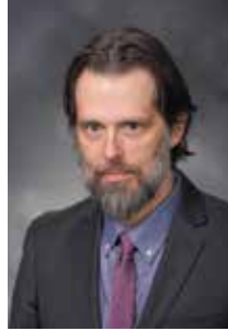
MIKE PRICE Deputy State Auditor

Audits are performed to determine how well governmental agencies and elected officials are