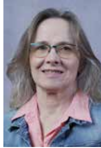
JANET CARUTHERS State Librarian

Wolfner Talking Book and Braille Library serves as the public library for Missourians unable to use standard print because of a visual or physical disability. A division of the State Library, the library loans a half million audio books and magazines in braille, recorded audio and large print from its collection of more than 300,000 volumes. The library also provides access to locally recorded Missouri titles and to over 90,000 titles via the Braille and Audio Reading Download (BARD) site. Audio players are also loaned to users of the recorded material. More than 9,000 individuals and 2,000 institutions, including nursing homes, schools, hospitals and hospices, use the library. Wolfner also provides reference and information services, children's program-