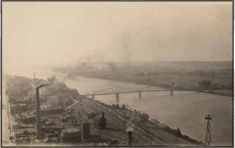
The Jefferson City “Millbottom” industrial area and original Missouri River bridge taken from the Capitol Building. The Union Pacific railyard and roundhouse as well as the Capitol Building power plant are visible.