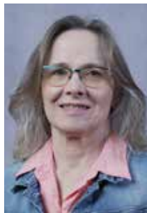
JANET CARUTHERS State Librarian

Wolfner Talking Book and Braille Library serves as the public library for Missourians unable to use standard print because of a visual or physical disability. A division of the State Library, the library loans a half million audio books and magazines in braille, recorded audio and large print from its collection of more than 300,000 volumes. The library also provides access to locally recorded Missouri titles and to over 90,000 titles via the Braille and Audio Reading Download (BARD) site. Audio players are also loaned to users of the recorded material. More than 9,000 individuals and 2,000 institutions, including nursing homes, schools, hospitals and hospices, use the library. Wolfner also provides reference and information services, children's program-